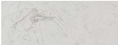
NEW E-1001 Blanco Silk