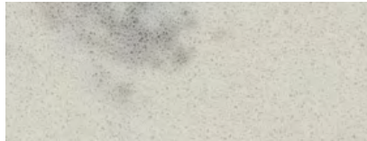
NEW E-1002 Canyon Mist